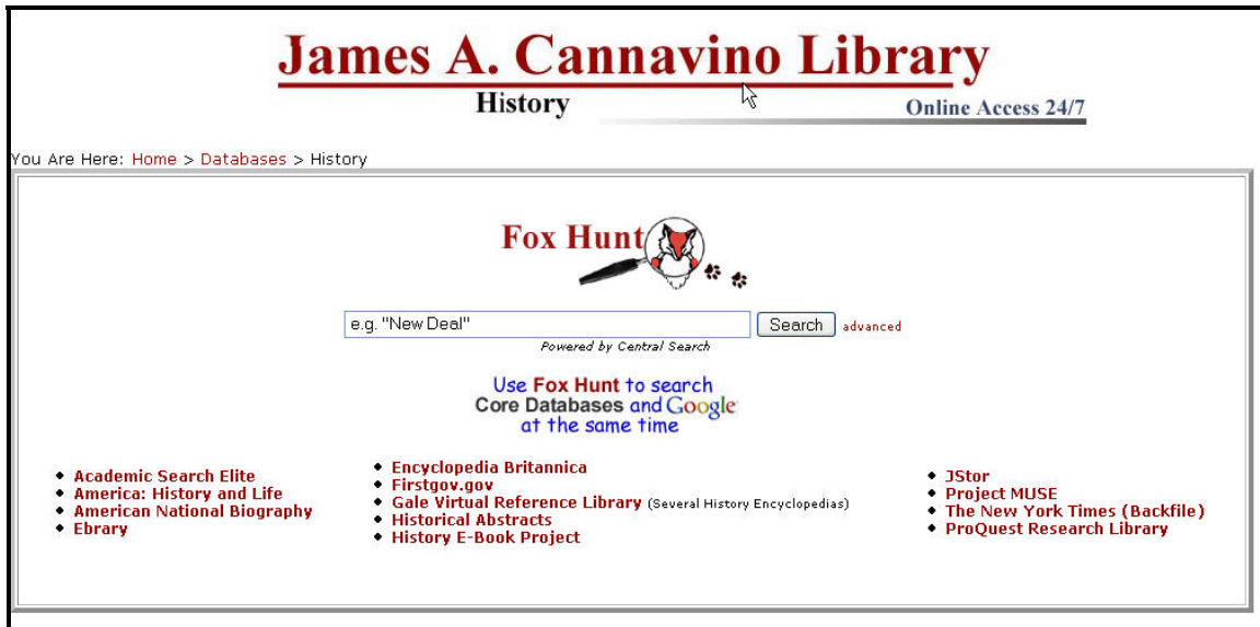
Figure 1 The Fox Hunt simple single search box

This “advanced” option linked to a guided search interface with the ability to select specific database titles to be searched.